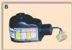
IP - 65 & IS:2147 (for Weather Proof)