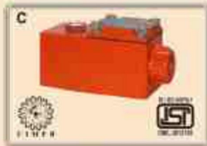
Explosion & flame proof solenoid available on request.

(As per IS / IEC 60079-1 standard approved by Central Institute of Mining and Fuel Research (CIMFR))